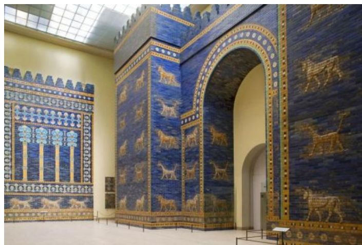
Above is the reconstruction of the Ishtar Gate and Processional Way at the Pergamon Museum, Berlin. It was reconstructed from material excavated by Robert Koldewey and completed in the 1930s

This occurred in 522-21BC when it revolted and was later captured for Darius by general Zopyrus (see Herodotus 3. 151-159). One of the walls was destroyed and its 100 gates dismantled during this siege that lasted around 2 years.