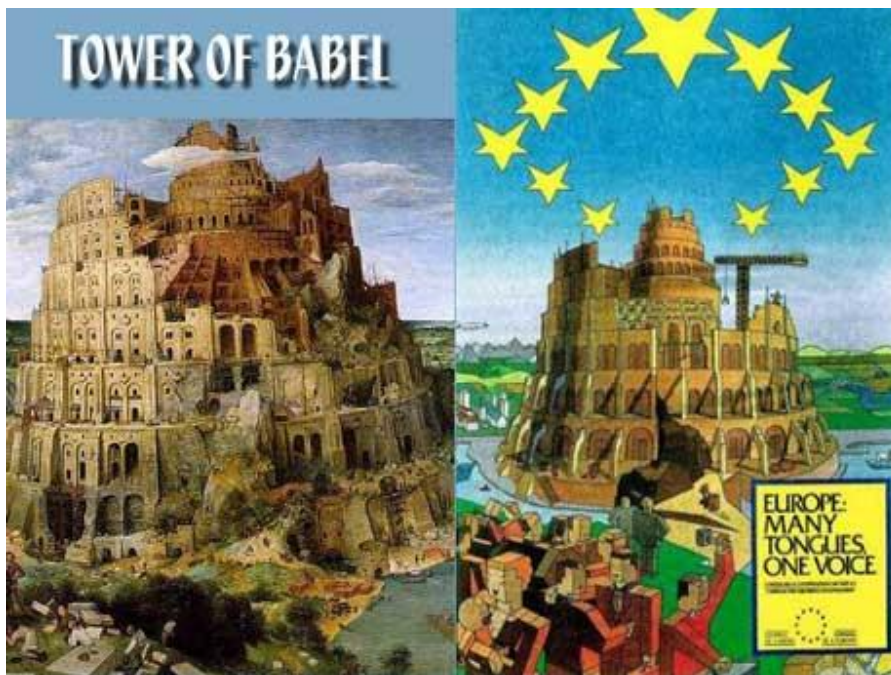
EU poster (left) compared to an artist's depiction of the tower of Babel (right)

(extracted from A Note on the Three Woes and Babylon/Tyre Parallels by C White)